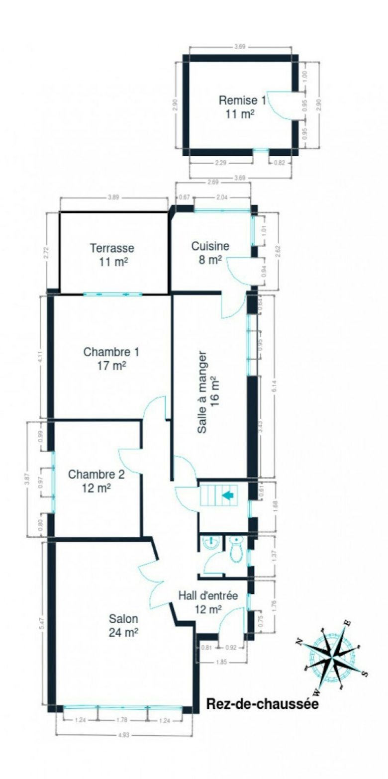
Les plans sont soumis à titre informatif et non contractuels.

Little tip: measurements are not always 100% perfect. A margin of error should be taken into account. So, before puzzling over your favorite wardrobe, apply a safety margin!